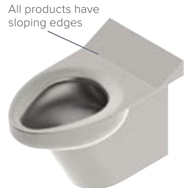
Model No: LR2141